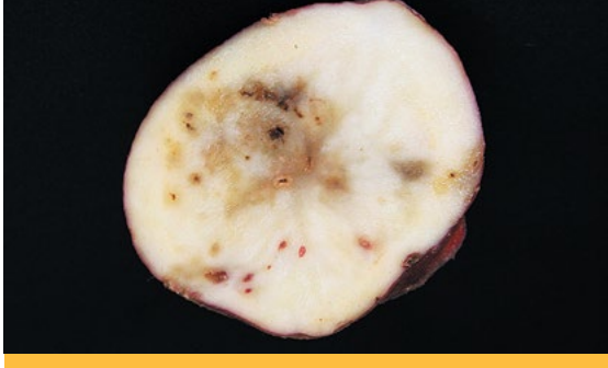
Tobacco Rattle Virus