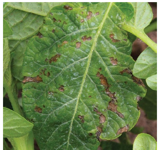
Phosphorous Acid Burn