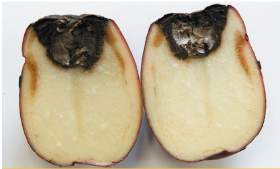
Stem End Fusarium