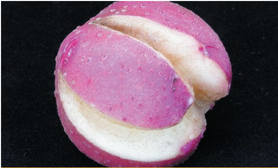
Tuber Cracking from Herbicide