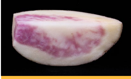
Internal Anthocyanin Pigmentation