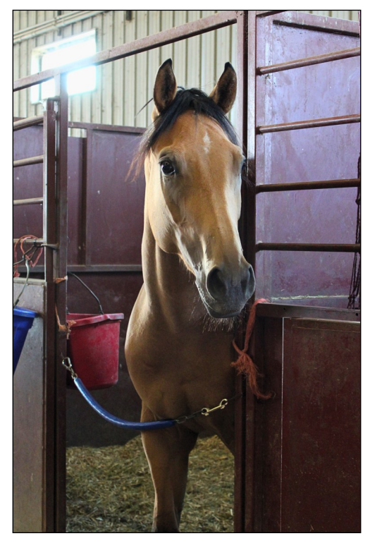
This is one of the 50-75 horses that make their home at the Equine Center during the school year.