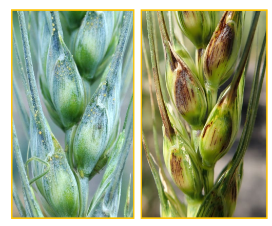
Figure 5. Bacterial exudate (ooze) on glumes of a newly infected wheat spike (left). After infection, dark purple to black streaks will develop on the glumes and awns (right).

Symptoms of BLS tend to become most apparent after thunderstorms and high-wind rain events (Figure 4C). However, these leaf diseases are difficult to differentiate at the later growth season when lesions coalesce and often they occur together as a leaf disease complex.