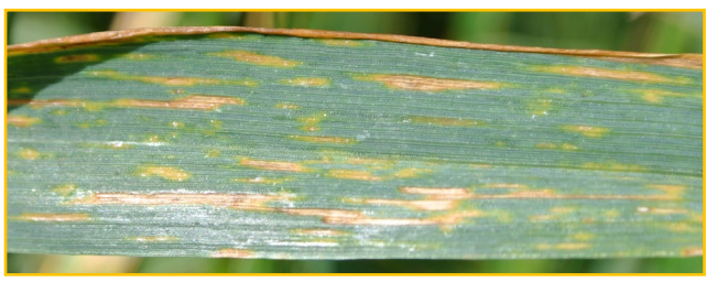
Figure 3. Bacterial ooze that hardens can give bacterial leaf streak lesions a shiny appearance.