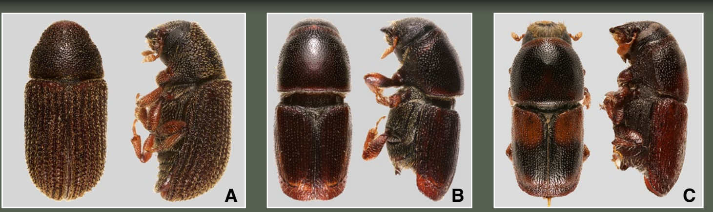
Figure 1. The three species of bark beetle found in North Dakota that spread DED: (A) native elm bark beetle — Hylurgopinus rufipes, (B) smaller European elm bark beetle — Scolytus multistriatus and (C) banded elm bark beetle — Scolytus schevyrewi.