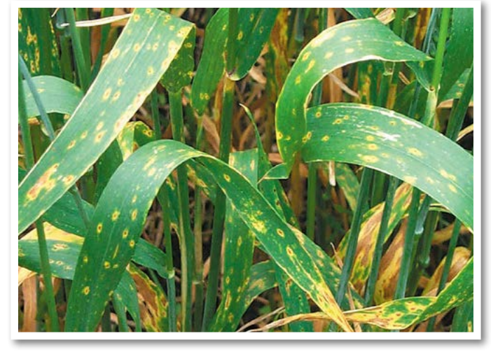
Figure 1. Wheat leaves with tan spot symptoms; note tan, necrotic center with yellow halo.

Zhaohui Liu Wheat Pathologist Department of Plant Pathology