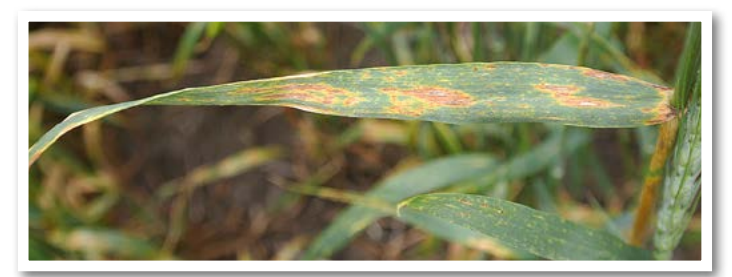
Figure 6. Symptoms of SNB. Notice the lens-shaped lesions with ashen gray centers and black specks (pycnidia).

Zymoseptoria tritici can survive for several years in the form of vegetative strands (mycelium), pycnidia and/or perithecia in wheat residues. Sexual spores (ascospores) from pseudothecia and asexual spores (pycnidiospores) from