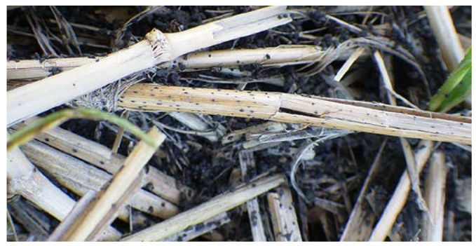
Figure 3. Notice the fungal structure size difference between the tan spot and Septoria/Stagonospora pathogens (top image). Overwintering structures for the tan spot fungus on wheat residue (bottom image).