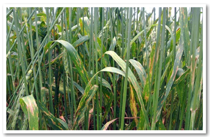
Figure 10. When fungal leaf spot diseases are not managed, significant damage can occur on the flag leaves.