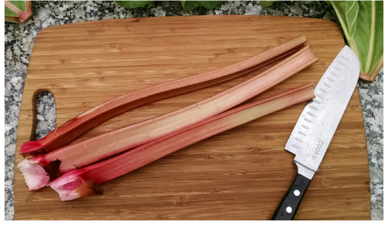
Fig. 6 Cut off the leaves entirely. "Slice the stalks - Stangen schneiden" by livewombat is licensed under CC BY-NC-SA 2.0

For planting location, soil types and varieties well suited to North Dakota, please see the NDSU Publication Asparagus and Rhubarb (H61, Revised March 2016).