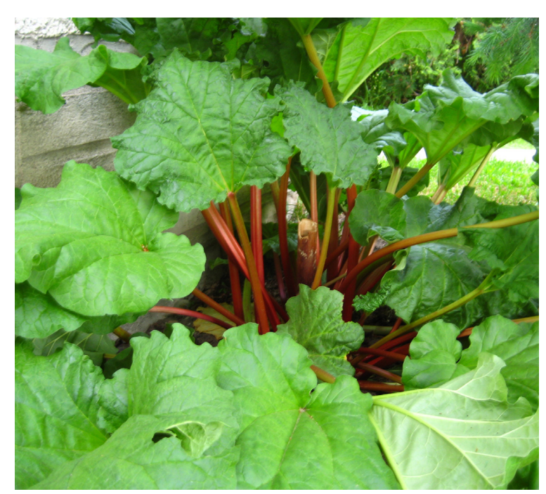
Fig. 3 Rhubarb ready for harvest.

Even within the scientific community there are varying responses as to when to use or discard rhubarb that has been subjected to a frost or hard freeze. NDSU Extension takes a conservative approach: If the leaf or petiole is soft or anyway wilted, or even after a few days shows black or dying vegetation, do not use it - remove and discard. You wouldn't want to eat something that looked bad or was mushy, anyway. The plant itself underground will be unaffected, along with subsequent new growth (Fig. 3).