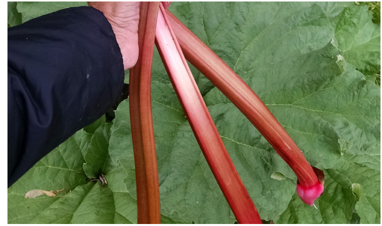
Fig. 5 "Picking rhubarb - Rhabarberstangen pflücken"