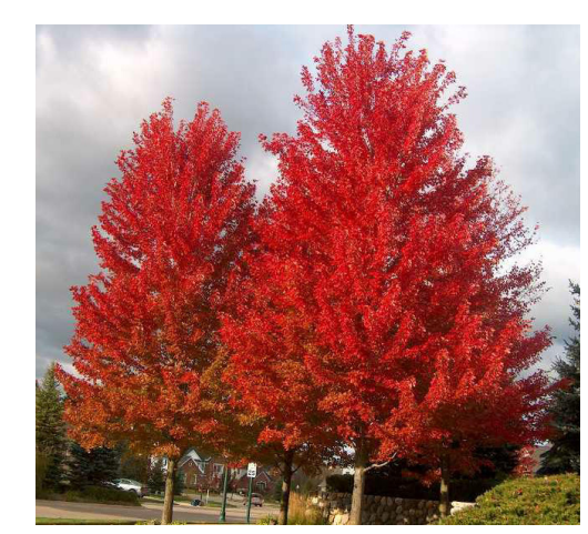
Fig 2 Red Maple