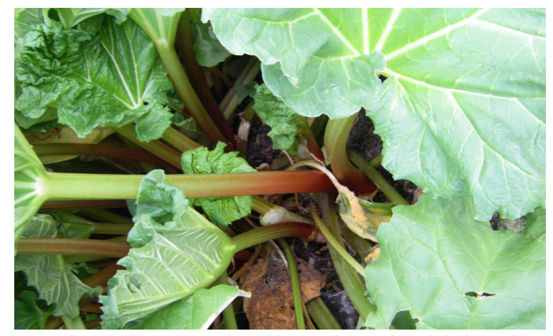
Fig. 4 Pull petioles by grasping as close to the ground as possible.