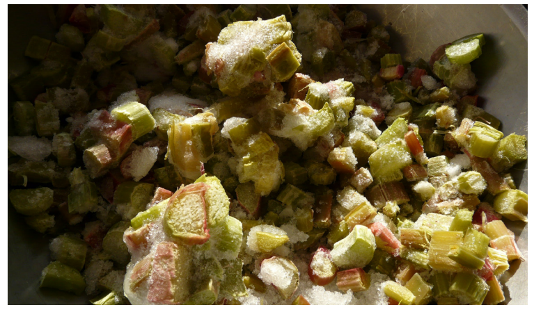
Fig. 7 Frozen rhubarb from your freezer can provide summer treats year-round. "frozen rhubarb" by Emily Barney is licensed under CC BY-NC 2.0