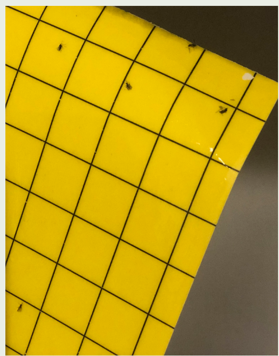
Fig. 2 Yellow sticky sheets, available in garden centers, attract and trap adult gnats. They are most effective when placed near the soil surface.

"But most of the time, they're just pests," he said.