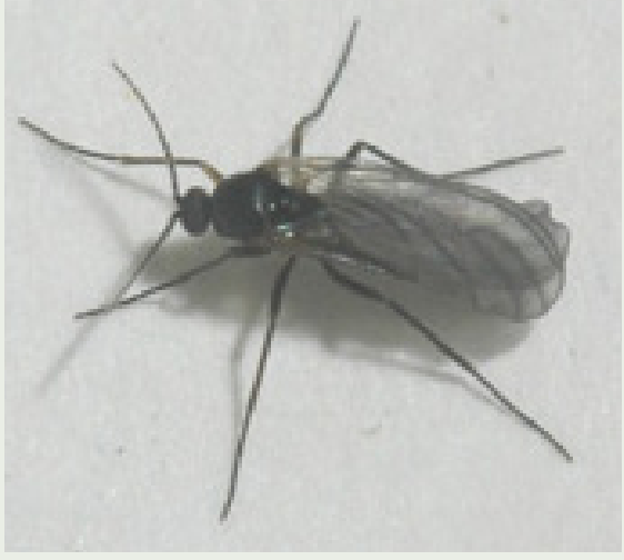
Fig. 1 Fungus gnats measure about 1/8th of an inch long and are frequently mistaken for fruit flies.

Ditto for spreading diatomaceous earth on the surface of the soil. It will break up the gnats' exoskeleton, causing them to dry out, but its effectiveness will diminish with watering, so may require