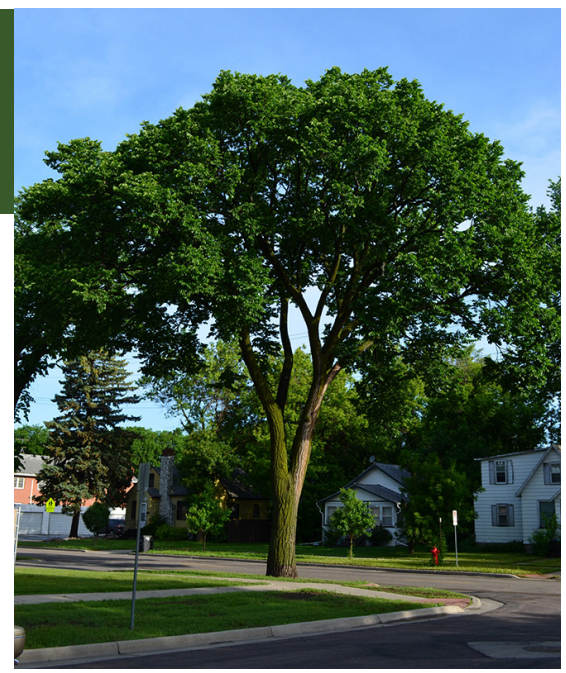
Fig. 1 2021_ElmLeaves

https://www.missouribotanicalgarden. org/PlantFinder/PlantFinderDetails. aspx?kempercode=a922