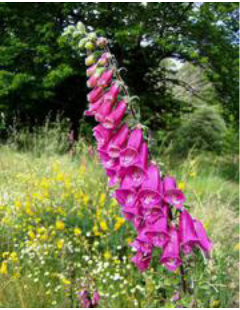
Fig 1 Foxglove

Animal Poison Control Center ASPCA Equus University of Minnesota