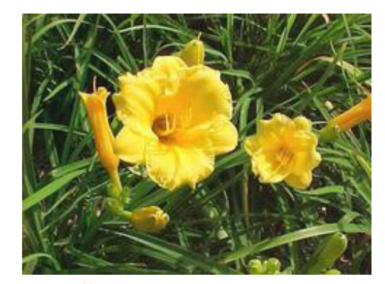
Fig 3 Daylily