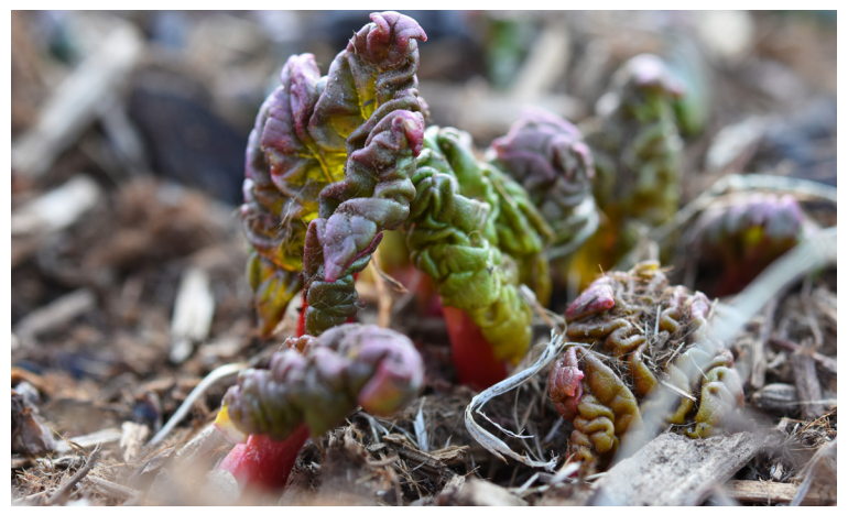
Fig. 1 New rhubarb shoots make their way through the winter mulch in mid- April.