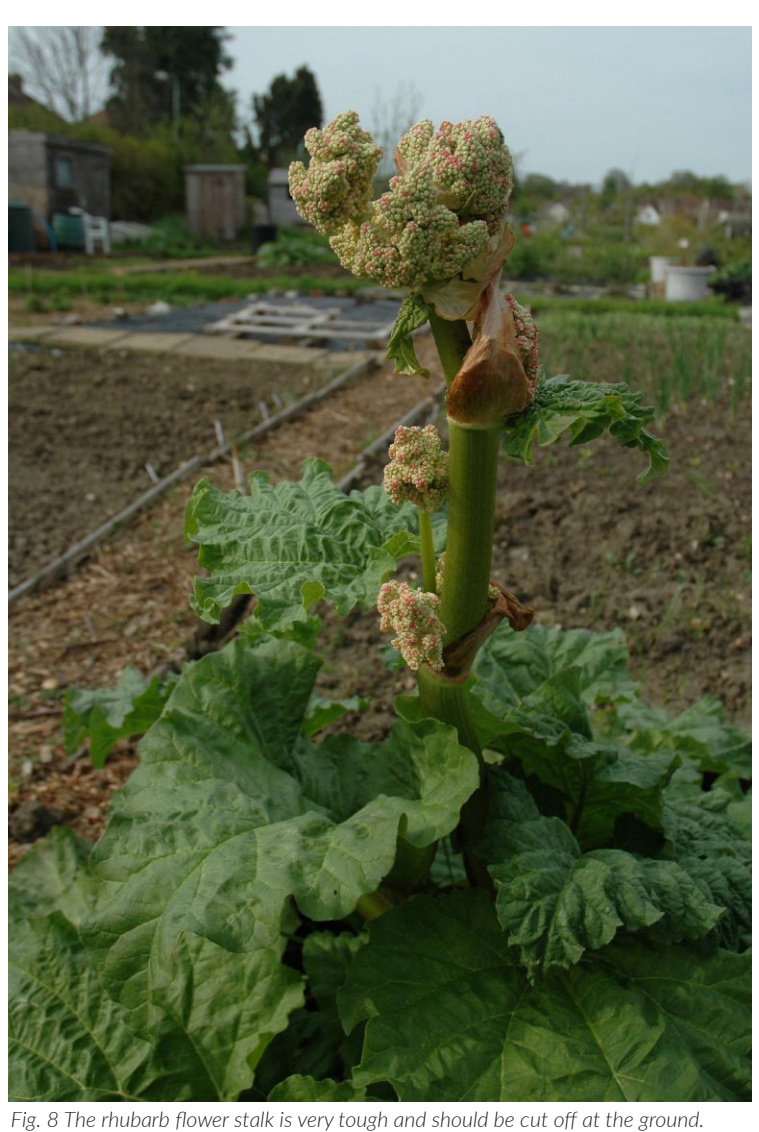
"Rhubarb Flower"