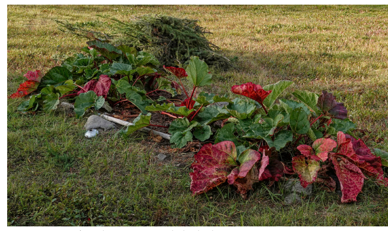
Fig. 9 At season's end, prepare your rhubarb plants for the winter ahead. "Tucking in the Rhubarb Bed" by JLS Photography - Alaska is licensed under CC BY-NC-ND 2.0

NDSU does not discriminate in its programs and activities on the basis of age, color, gender expression/identity, genetic information, marital status, national origin, participation in lawful off-campus activity, physical or mental disability, pregnancy, public assistance status, race, religion, sex, sexual orientation, spousal relationship to current employee, or veteran status, as applicable. Direct inquiries to: