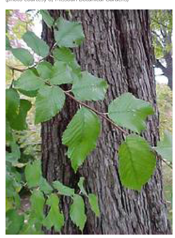
Fig. 2 2021_AmericanElmFargo