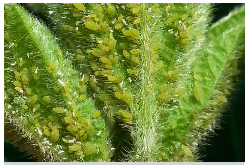
Figure 1. Soybean aphids infesting a soybean leaf.

Failures of certain pyrethroid insecticides for management of some soybean aphid populations have been observed in commercial fields (Figure 2), and resistance to bifenthrin and lambda-cyhalothrin has been documented through small-plot research, laboratory bioassays and molecular research. Because of the mobility of winged soybean aphids, the challenges posed by insecticide-resistant populations of the pest could spread to soybean fields in other parts of the region.